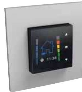
Wireless air quality sensor

By default, the Endura Delta is equipped with internal air quality sensors. However, it is also possible to install external sensors (CO 2 ) in the dry rooms. This will allow the system to react even faster to changes in indoor air quality. The air quality sensors give an indication of the active ventilation level and the actual air quality with a colour scale from green to red.